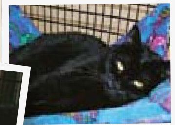
▲ Zelda (above) and Elizabeth (left) are two of the 21 rescued cats.

This could be your organization! With support from a PetSmart Charities grant, thousands of agency partners provide life-saving programs and services to help homeless pets in their communities. We want to help celebrate your success. If selected, your organization will win a one-time award of $500 and be featured in an upcoming issue.