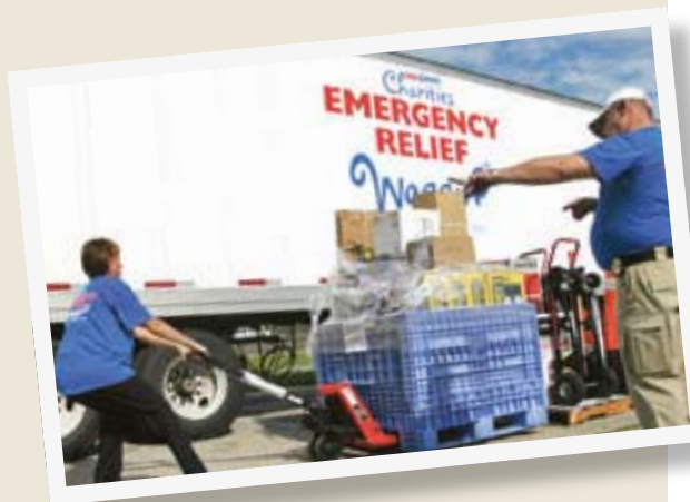
Volunteers practice unloading emergency supplies.

Healing HEART Sanctuary has been tapped to recruit, train and manage volunteers for unloading and reloading supplies, at the beginning and end of a response. 🐾